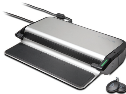
LD5400T Single-User Thunderbolt 3 Universal Dual 4K Dock with K-Fob™ Smart Lock