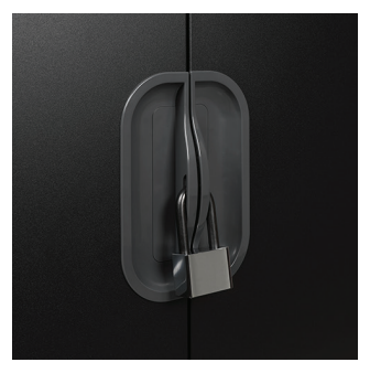
Lockable Front and Rear Doors

Neatly and easily charges, transports, locks and stores up to 32 devices (up to 15.6" each).