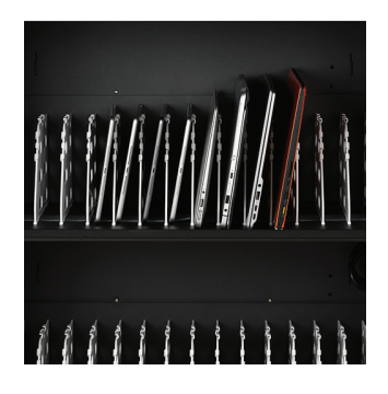
Holds up to 32 Devices

Part Number: K62327EU, EAN Code: 5028252619363 | Part Number: K62327UK, EAN Code: 5028252620222