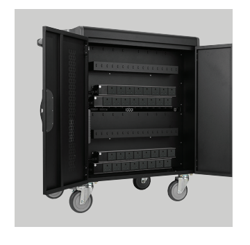
Smart Charging Technology

Allow for easy movement over rough and uneven surfaces.