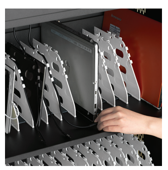
Built-In Dividers and Cable Management

Provides a sturdy, secure point to attach a security cable (security cable and padlock not included).