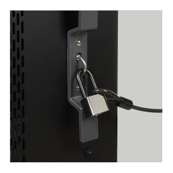
Security Cable Attachment Ring

Allow you to secure the devices inside (padlocks not included).