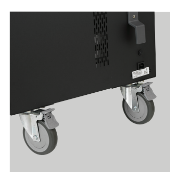
5" Removable Non-Marking Locking Castors

Organises devices and cables and keeps bulky adapters out of the way.