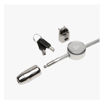
Elegant Locking Solution Perfectly complements

Part Number: K63150WW | UPC Code: 0 85896 63150 7