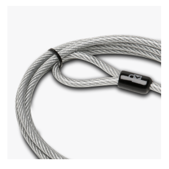
Carbon Steel Cable

Lock modules can be used together or individually.