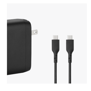
Includes a 6 Foot (2 Meter) USB-C Cable

Designed to work with Kensington bus-powered USB-C mobile hubs and docks, MacBooks, iPads, Surface devices, and more.