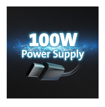
100W USB-C Power Supply

Part Number: K33821NA | UPC Code: 0 85896 33821 5