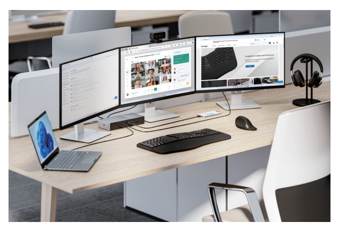
Triple 4K or Dual 8K Support

The SD5000T5 offers lightning-fast data transfers, achieving speeds up to 80Gbps, with Bandwidth Boost providing up to 120Gbps for video-intensive usage.