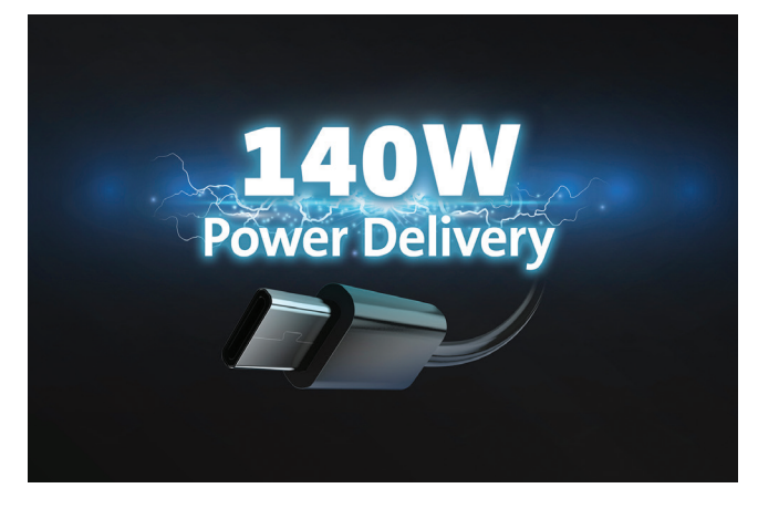
Up to 140W Power Delivery

Supporting up to 3 x 4K monitors @ 144Hz or 2 x 8K monitors @ 60Hz, the SD5000T5 supports uncompromising visual quality and smooth multitasking for a high-performance workspace.