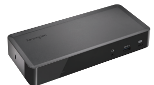
SD4700P Universal USB-C and USB 3.0 Docking Station K38240EU