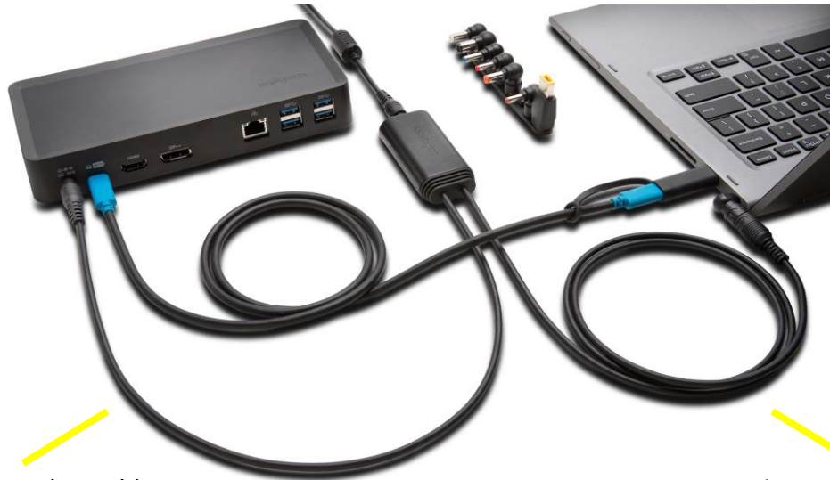
0.5m power plug cable (connects to SD4700P)