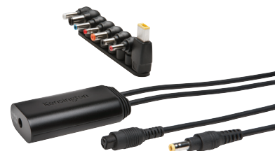
60W USB 3.0 Power Splitter for SD4700P K38310EU