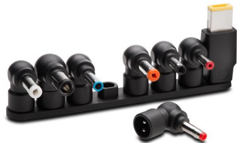
Retention ring to hold power tips