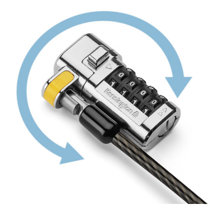
Special pivot and rotate hinge on the cable allows flexible movement.