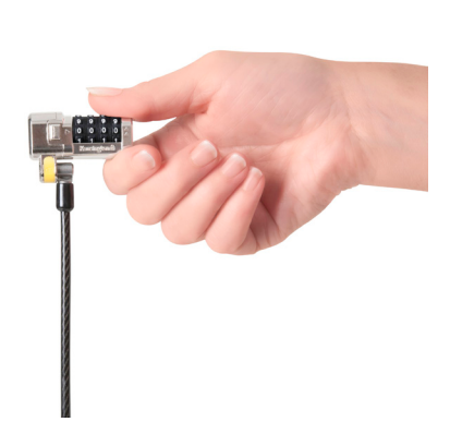
ClickSafe® locking technology allows the lock head to be attached with one hand in a single click

Part Number: K67936WW | UPC Code: 0 85896 67936 3