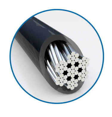
1.8m (6 ft.) carbon steel cable with plastic sheath resists tampering, offers peace-of-mind, and delivers the same level of cut and theft resistance as thicker cables.