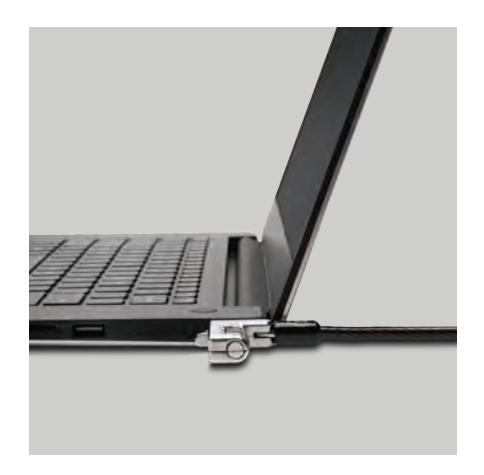
Allows Ultra-Thin and 2-in-1 Laptops to Lie Flat and Stable

Slim Combination Laptop Lock (Resettable) – Part Number: K60600WW | UPC Code: 0 85896 60600 0 Slim Combination Laptop Lock (Serialised 25-pack) – Part Number: K60602WW | UPC Code: 0 85896 60202 4