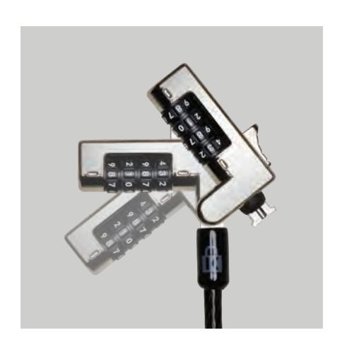
Pivot and Rotate Cable Head Featuring One-Handed Operation

Expanding side "hooks" grab the internal sides of the lock slot, creating a strong connection between the device frame and the lock to resist and deter theft.