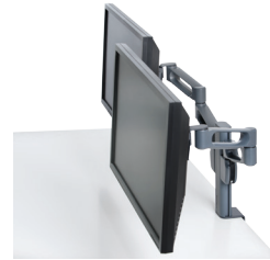
SmartFit® Dual Monitor Arm Mount

Raise Your Productivity to Professional Levels