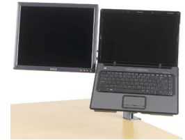
SmartFit® Monitor & Laptop Mounting Arm

Professional-Level Mount to Increase Productivity