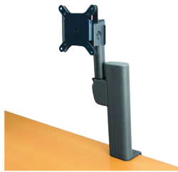
Column Mount Monitor Arm with SmartFit® System