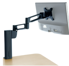
Column Mount Extended Monitor Arm with SmartFit® System

Raise Your Productivity to Professional Levels